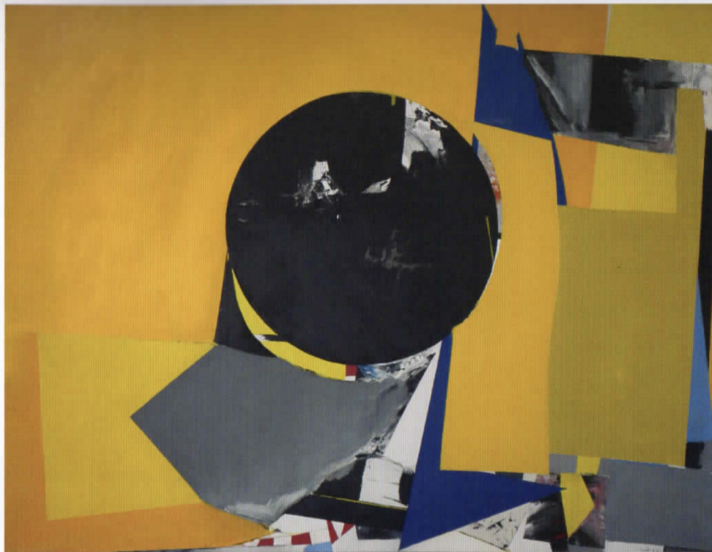
SUN BLACK I 1966 oil on canvas 40 x 52 inches