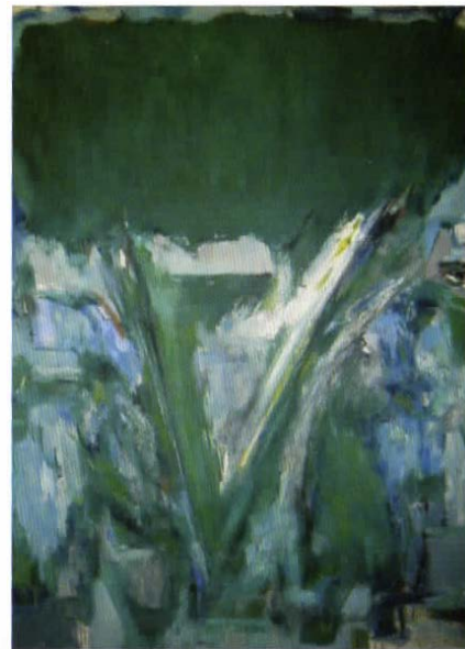
LASSEMAN 1958 oil on canvas 70 x 50 inches PRIVATE COLLECTION

By the time he painted Lassemann in 1958, in which a Rothko-like rectangle floats near the top supported by a central triangular form, Hopkins had begun to shift into a much more powerful compositional gear. In 1959 and 1960 he began to underline this stability with a somber, predominantly gray, blue, and brown range of color. Curvilinear forms yielded to the domination of straight lines and square edges during these years, notto reassert themselves until the mid-sixties with the re-emergence of the circle in his work. While the structural scaffoldings became more architecturally sound, his brushwork became increasingly freer and more arbitrary. His technical handling of paint—splattering, scraping, scumbling, dragging, and dry brushing it across the surface—reached a peak of facility during the early