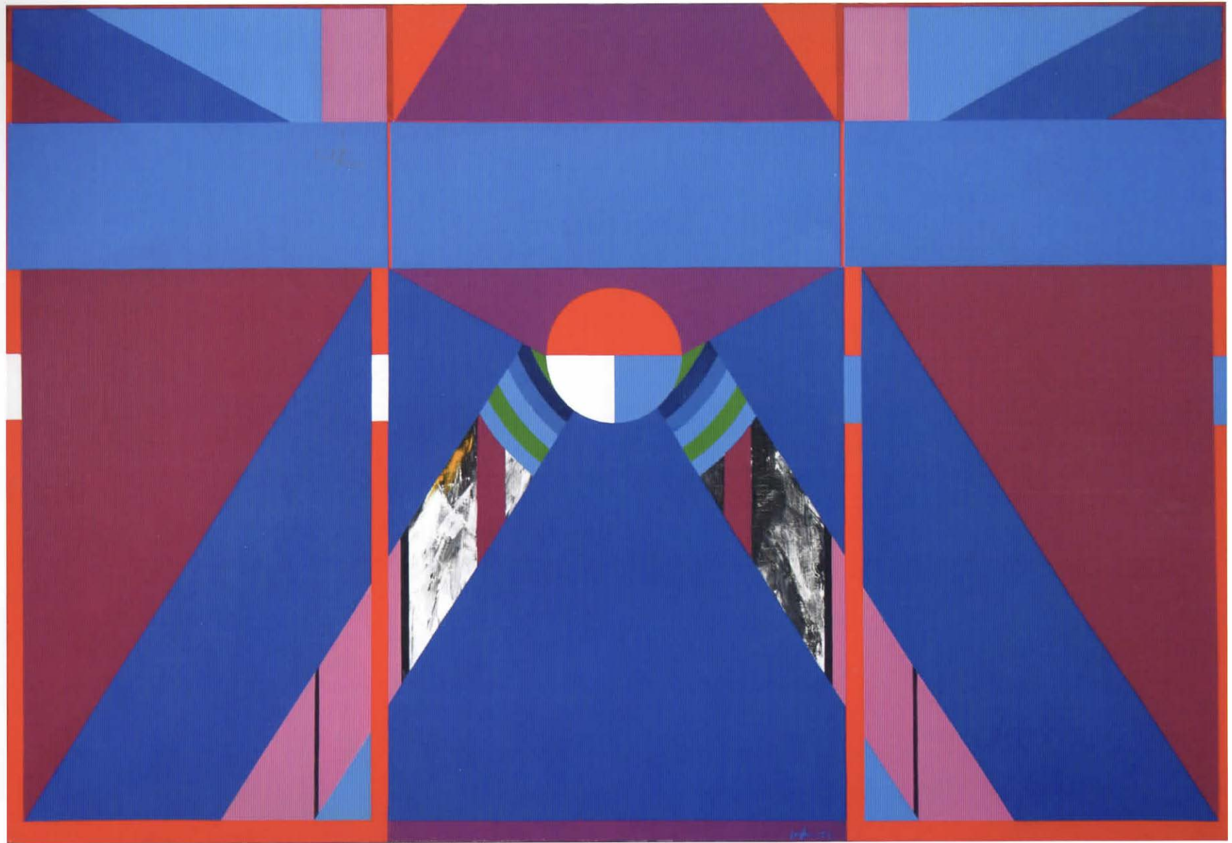
Catalogue Cover / Frontispiece - "Study for Mahler's Castle" (1972)