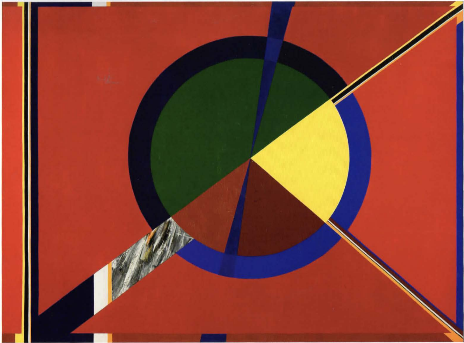
SCORPIO III 1972 oil on canvas 52 x 70 inches