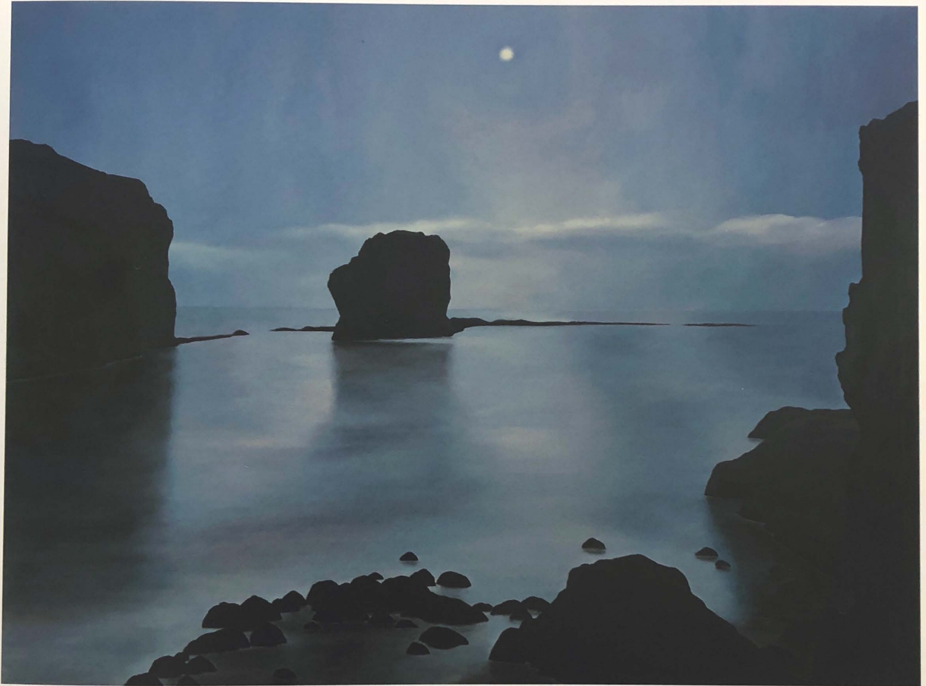
70. Moon Bay , 1996 Oil on linen, 72 × 96 inches Private collection, Norwood, New Jersey