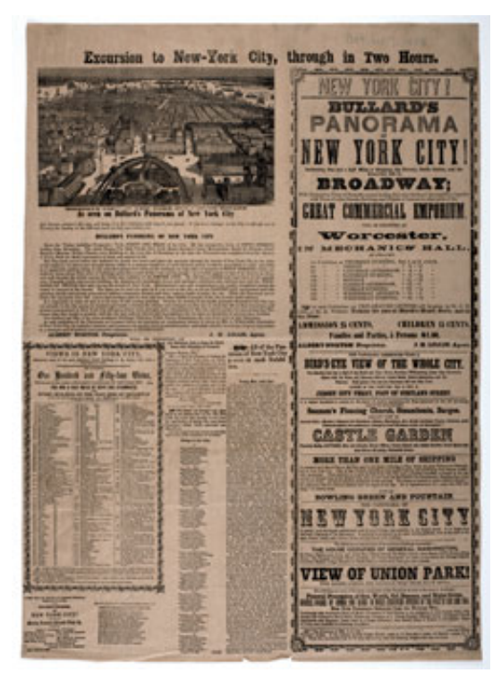
Fig. 1. "Excursion to New York City, through in two hours, New York City! Bullard's Panorama of New York City!... Worcester in Mechanics' Hall," advertisement/broadside, one sheet, 60 x 43 cm. (October 7, 1858). Click to enlarge in new window

materials, newspaper testimonials, a descriptive pamphlet, and a few other scattered documents (fig. 1). Though the panorama's original paintings have been lost to history, these surviving artifacts have much to teach us about the marketing and presentation of Bullard's work, and about the meaning of New York City in the mid-nineteenth-century national imagination.